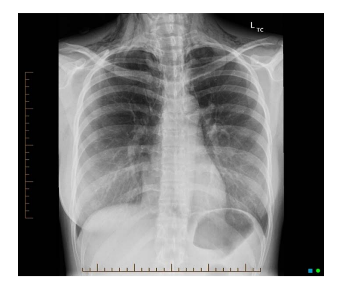
Figure 1. Chest Xray of the patient demonstrating pneumomediastinum and subcutaenous emphysema over the neck and upper chest.

The patient was reviewed an hour later with worsening painful respiration and chest tightness. The patient had persistent tachycardia at 134 beats per minute and had a new low-grade fever of 37.9°C. The palpable crepitus remained and on repeat auscultation of the chest there was concern about decreased breath sounds in the right upper zone. A plain chest X-ray was requested. This showed extensive pneumomediastinum with subcutaneous emphysema noted at the base of the neck bilaterally. Nil pneumothorax was identified. The findings of the X-ray were discussed with the cardiothoracic team at the nearest tertiary unit. A non-contrast CT chest was recommended to exclude oesophageal tears as well as a barium swallow. Supplemental oxygen via nasal prongs was recommended to help dissipate the emphysema. The CT chest and neck revealed a large volume pneumomediastinum with subcutaneous emphysema over the anterior chest wall and throughout the neck. No obvious oesophageal injury was identified. To complete the investigations, a barium swallow chest X-ray was performed two days postpartum which also revealed no perforation. A diagnosis of Hamman's syndrome was then made.