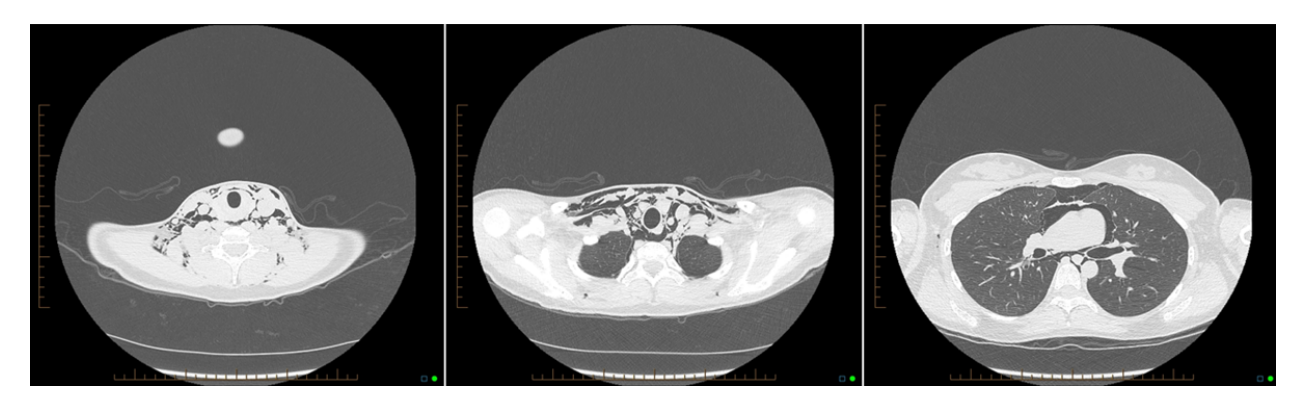
Figure 2. Three axial slices from the non-contrast CT, again demonstrating extensive pneumomediastinum and subcutaneous emphysema.